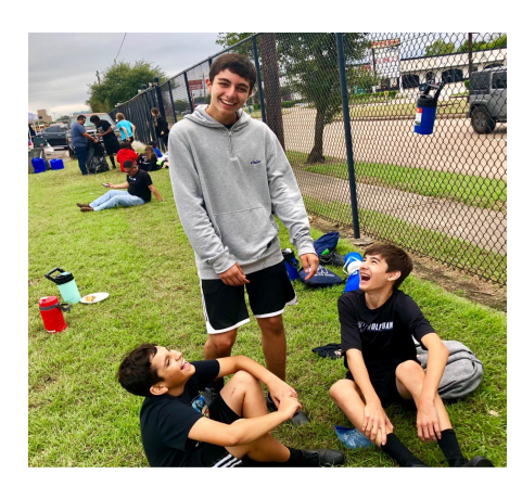
Become a Wolf Band Member for a truly life-changing experience! www.wolfband.org